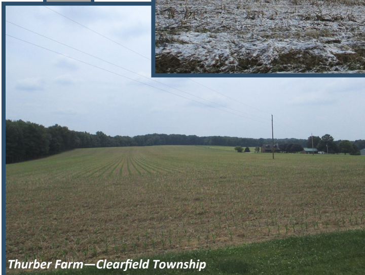
Thurber Farm—Clearfield Township