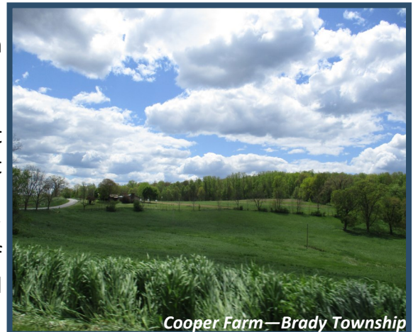
Cooper Farm—Brady Township