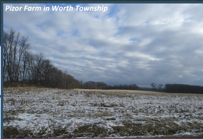
Pizor Farm in Worth Township