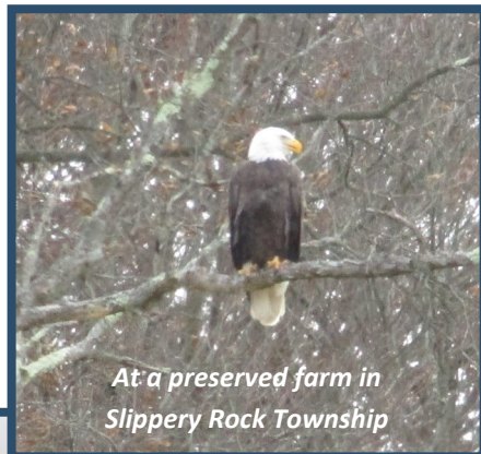
At a preserved farm in Slippery Rock Township