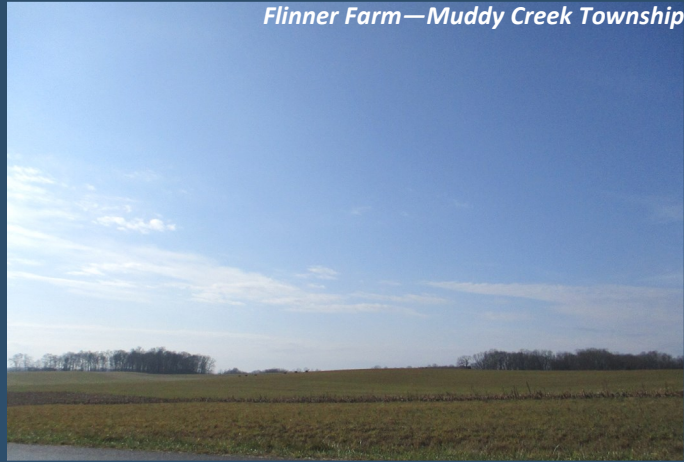
Flinner Farm—Muddy Creek Township