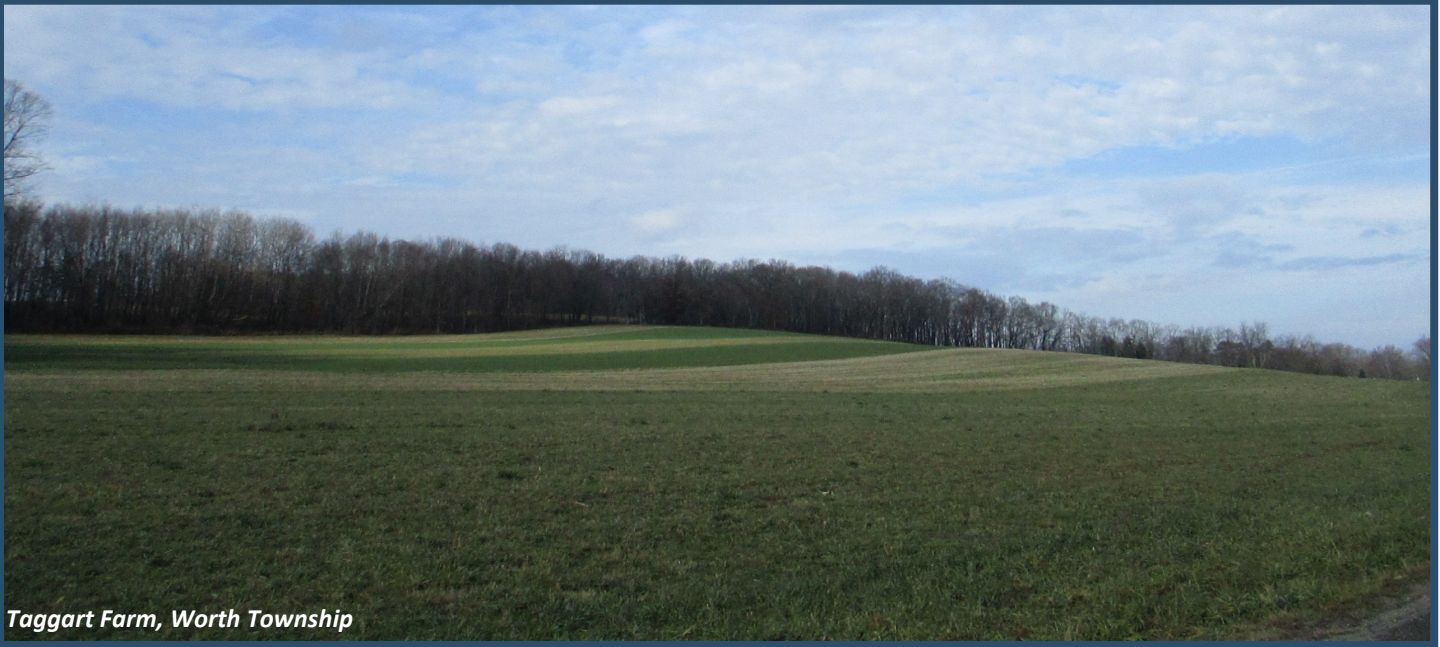
Taggart Farm, Worth Township