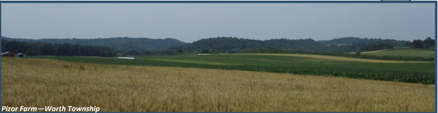
Pizor Farm—Worth Township